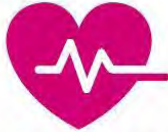
Health and Wellbeing