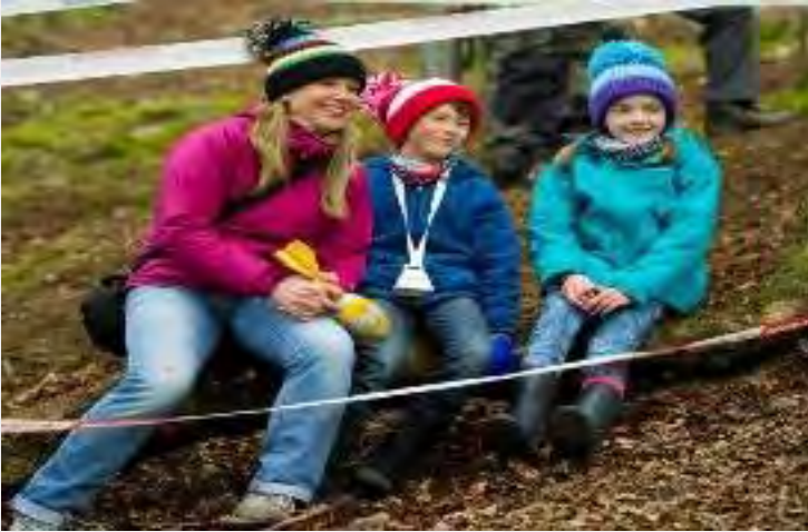
FAMILIES WITH CHILDREN