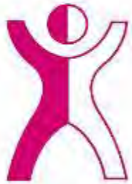
Equality and Discrimination