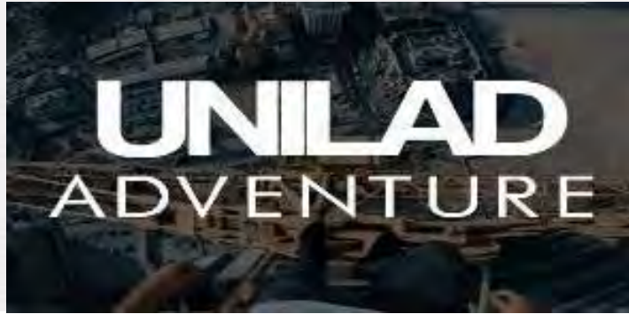
NEW GENERATION CAMPAIGN