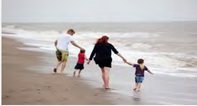
INCLUSIVE TOURISM CAMPAIGN