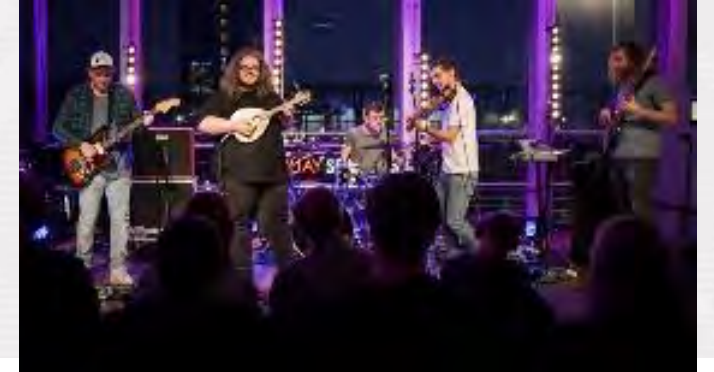
CELEBRATING SCOTLAND'S VIBRANT CONTEMPORARY TRAD MUSIC SCENE