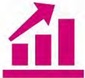
Enterprise and Regeneration