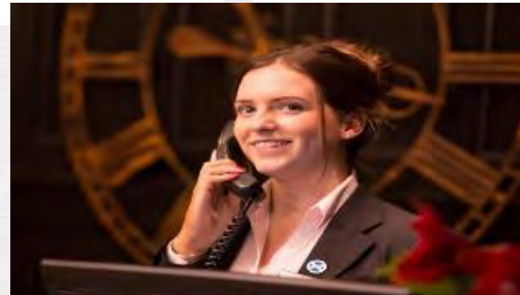
FUTURE FOCUS – CONTENT GENERATION