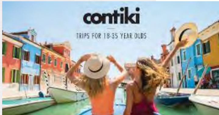
PARTNERSHIP WITH CONTIKI