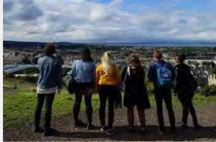
YOUNG SCOTS AND UK MILLENNIALS