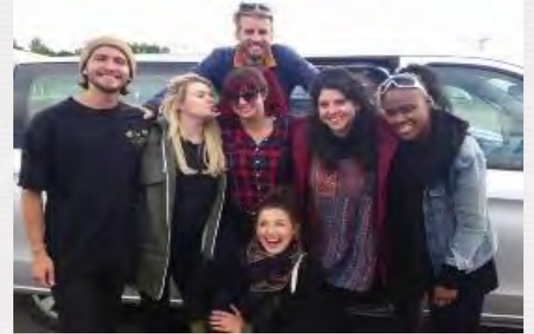
YOUNG INTERNATIONAL TRAVELLERS